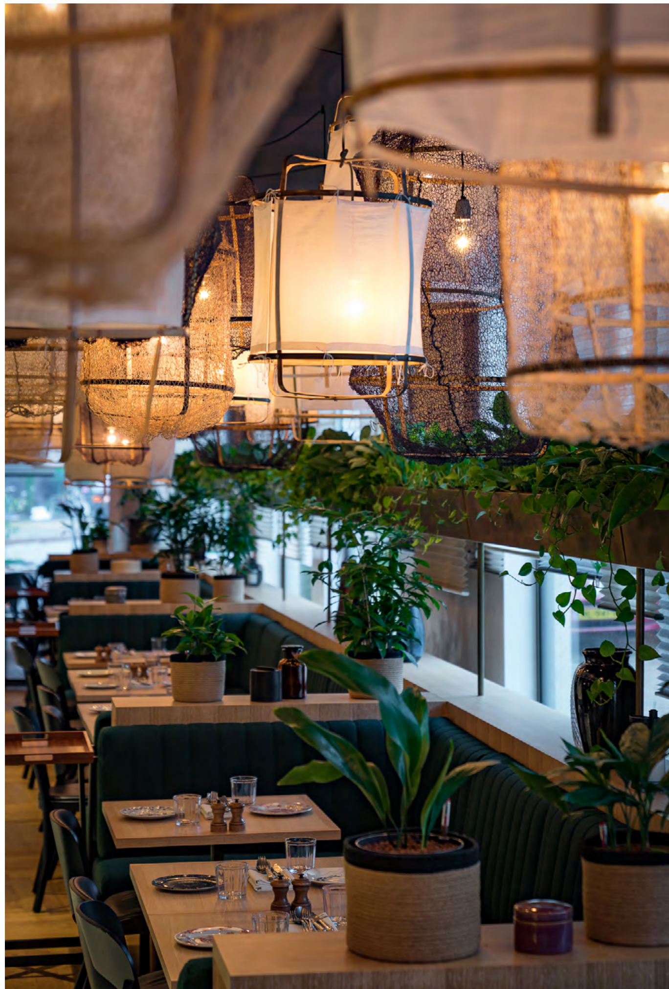
Z5 - BLACK FRAME