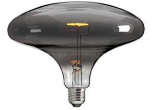
LED UFO E27

Dimmable, Energy class G Rock: 3W - 2200K 60lm - 164x200 mm