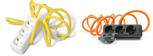
EXTENSION 3-WAY WHITE - BLACK