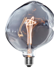
LED ROCK E27

Dimmable, Energy class G Flake: 1,1W - 2000K - 45lm Stella: 1,1W - 2000K - 45lm 200x230x65mm