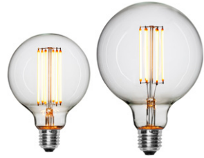
LED STRAIGHT E27

Dimmable, Energy class G Spiral: 1,5W - 2200K 100lm - 125x178mm