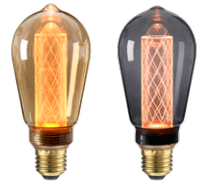
LED CIRCUS AMBER - BLACK

Dimmable, Energy class G Gold: 3,5W - 2000K Black: 3,5W - 2000K 60lm - 125x165mm