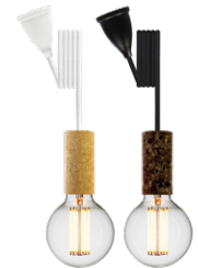
CORK Sand - Soil