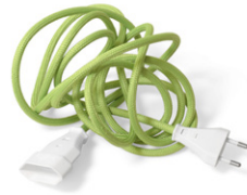
EXTENSION 1-WAY WHITE - BLACK