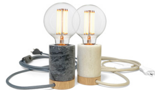
MARBLE Table lamp

Glass: Clear - Space Ø 125mm, Ø 150mm Ø 170mm