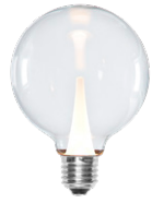
LED SPEAR E27

Dimmable, Energy class F / G 2W - 2200K - 115lm 6W - 2700K - 700lm Straight 95: 95x140mm Straight 125: 125x175mm