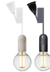
BASE Concrete - Iron