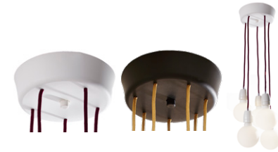
CEILING CUP WHITE - BLACK

3 entry hole, metal Ceiling cup compatible with Bluetooth dimmer H 35mm D 200mm Includes: Cord grips, mounting, terminal blocks