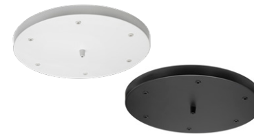
CEILING CUP WHITE - BLACK

Square: Black PIN: Black 87mm Garden Leaves: Polyester 100% Color TT-45 Online Lime