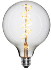
LED SPIRAL E27

Dimmable, Energy class G Spin: 3W - 2200K 130lm - 125x175mm