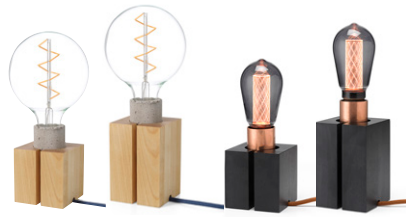
BLOCK BJORK BIRCH - BLACK

Compatible with all NUD pendants. Includes 2 cork patches