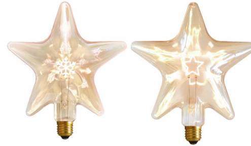
LED STAR E27

Dimmable, Energy class G Spear: 2W - 2200K 60lm - 95x130mm