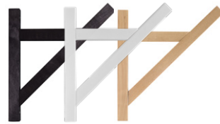
BRACKET WALL SUSPENSION

Ceiling Suspension 3-pack, Iron, L 60mm W 20mm Small pigtail hooks black and white