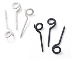
HOOK WHITE - BLACK

BIRCH: Oiled Birch Block BLACK: Black Painted Birch Block Small: H 85mm D 85mm Big: H 125mm D 85mm