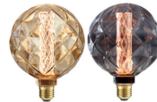
LED ROMB GOLD -BLACK E27

Dimmable, Energy class G Curve: 3,5W - 1800K 60lm - 125x165mm