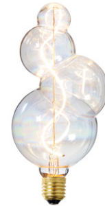
LED BUBBLE E27

Dimmable, Energy class G 2,5W - 200lm - 3000K White 80: 80x120mm White 95: 95x140mm White 125: 125x170mm