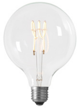
LED SPIN E27

Dimmable, Energy class G Spin: 3W - 2200K 130lm - 125x175mm