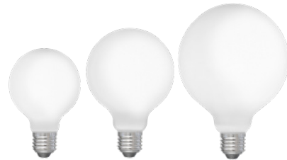
LED WHITE E27

Dimmable, Energy class F Nova replacement: 3,6W - 3000K 290lm - 35x48mm