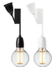
CLASSIC Black - White

Anodized aluminum, black, white, black chrome H 80mm D 41mm