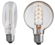
LED FLAT - EXIT E27

Dimmable, Energy class G Ufo: 3W - 2200K 83lm - 200x152mm