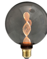
LED CURVE E27

Dimmable, Energy class G Bubble: 3W - 2200K 95lm - 100x235mm