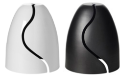
TRACE SHADE WHITE - BLACK

Ceiling Suspension Iron, includes: 2 screws H 70mm D 120mm W 100mm