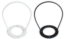
LOOP WHITE - BLACK

For multiple pendants: 3, 5 or 7 entry holes Plastic, H 56mm D 196mm Includes: Cordgrips, hook, terminal blocks