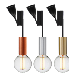
TUBE Aqua - Foil - Rail